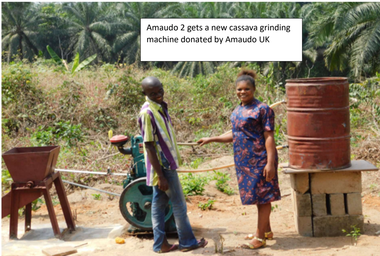
Amaudo 2 gets a new cassava grinding machine donated by Amaudo UK