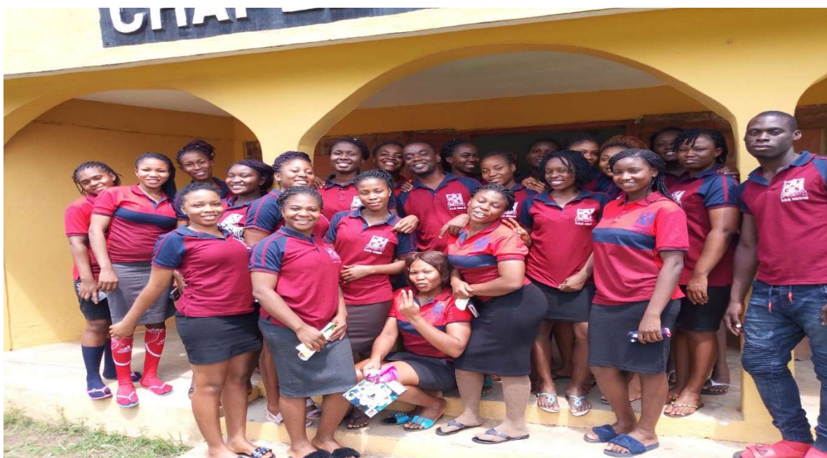
Figure 3 Student nurses at Amaudo for experience

Amaudo provides community mental health care experience for student nurses from various Schools of Nursing and Universities in Nigeria like the Federal School of Psychiatric Nursing Calabar, School of Nursing Federal Medical Centre Umuahia, School of Nursing Abia State University Uturu, Abia State University Teaching Hospital Aba etc. Over 1050 students have participated in community mental health care experience since 2014. The training has helped the students to improve their skills in providing mental health care thereby improving the quality of care for the people with mental disorders. The training for student nurses in mental health care enhance the proper integration of mental health care within the Primary Health Care in Nigeria.