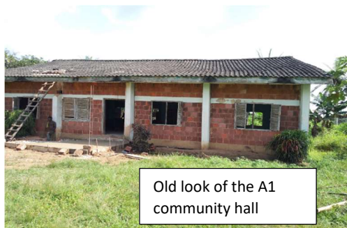
Old look of the A1 community hall