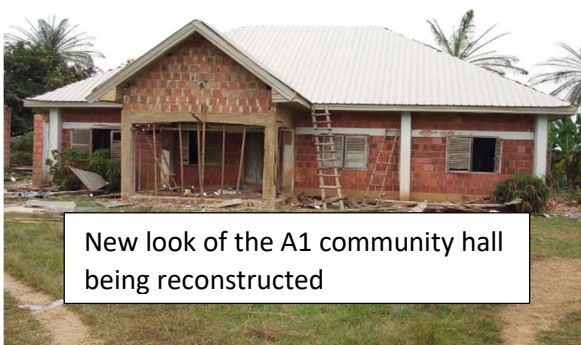
New look of the A1 community hall being reconstructed