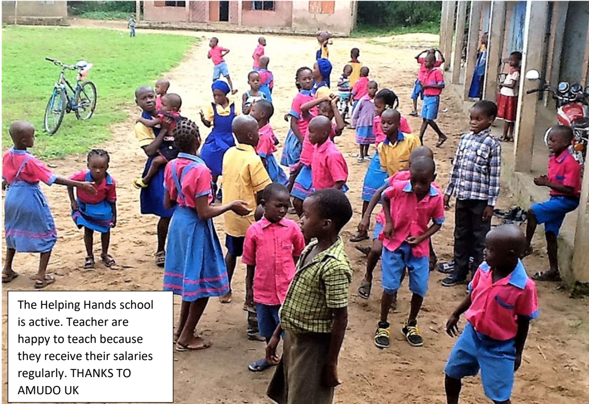
The Helping Hands school is active. Teacher are happy to teach because they receive their salaries regularly. THANKS TO AMUDO UK